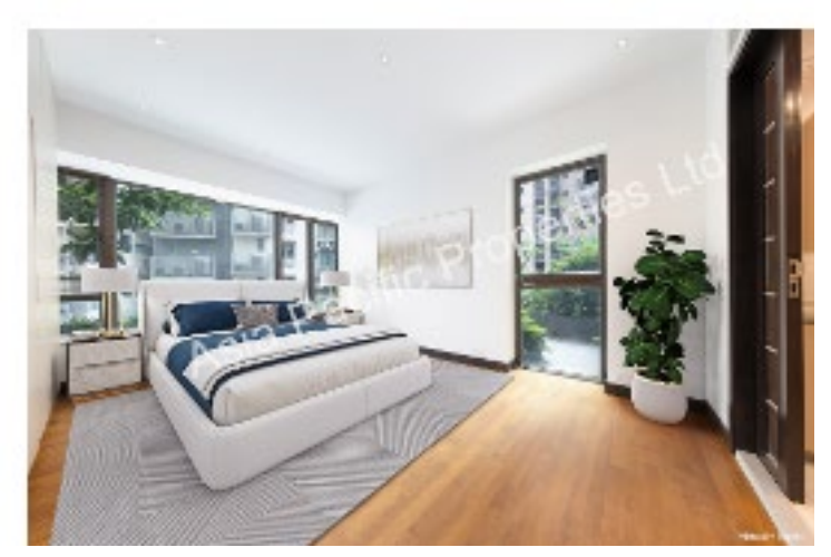
For identification purpose only(furniture not included) Subject to contract and availability